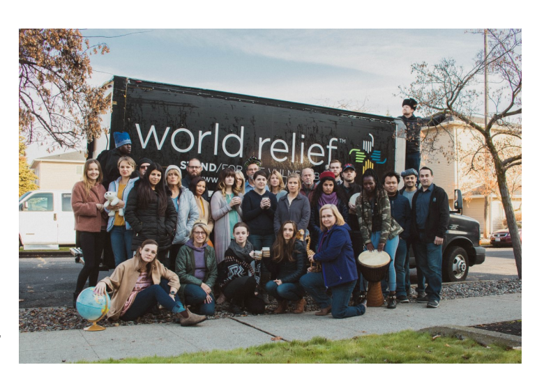
The World Relief team in Spokane - dedicated and fun!

Please pray for wisdom and insight as I get to know the needs of churches and volunteers who work to bless Spokane's refugees and immigrants.