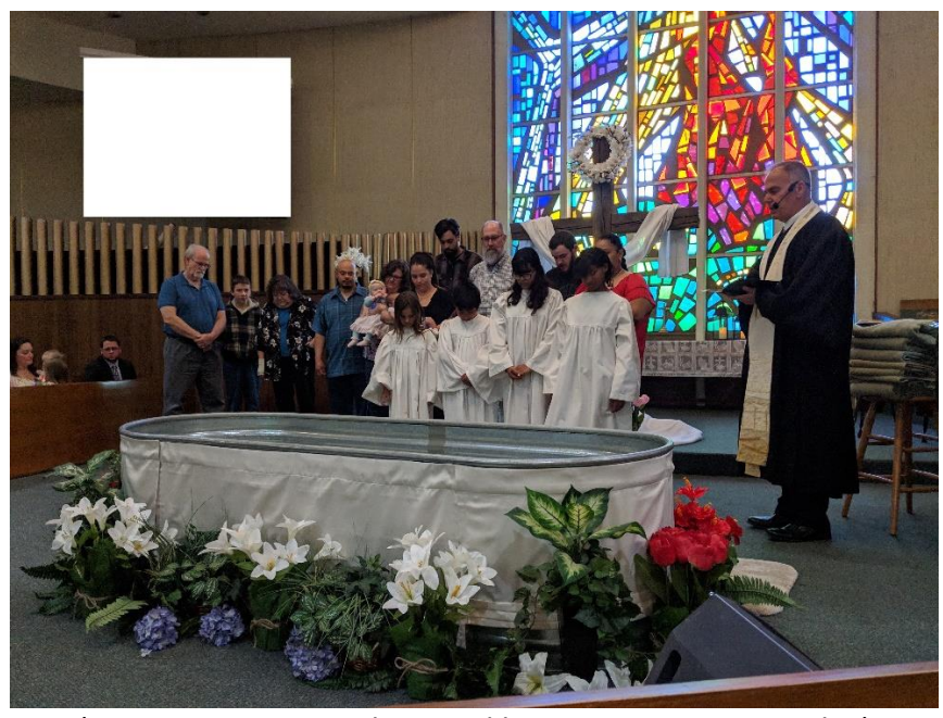
(Receiving new members and baptisms ~ Easter Sunday)

It has long been an expressed desire of our congregation to reach out to young families, to grow our numbers, to bring God's love to our community. Please consider investing your time in this <u>saving</u> work. God offers an amazing reward when you do so.